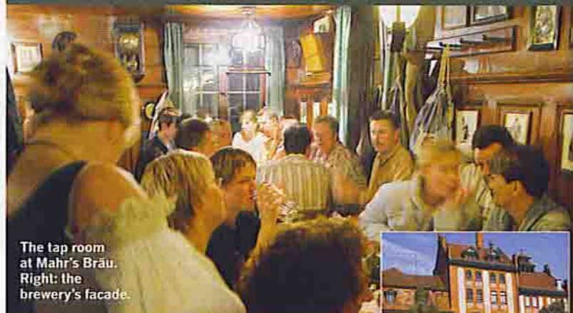
The tap room at Mahr's Bräu. Right: the brewery's facade.

IN A TOWN IN SOUTHEASTERN GERMANY, YOU'LL FIND CRAFT BREWING AT ITS FINEST